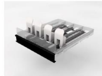
Product trays with spring merchandising.