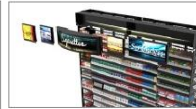
Modular header system.

12" fixture width modularity. Easy planogram modularity. Signature dimensional lit header. Grid backwall.