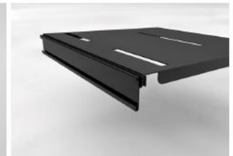
Metal shelf supports & optional sign channel.