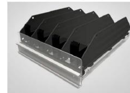
Adjustable dividers and pushers.